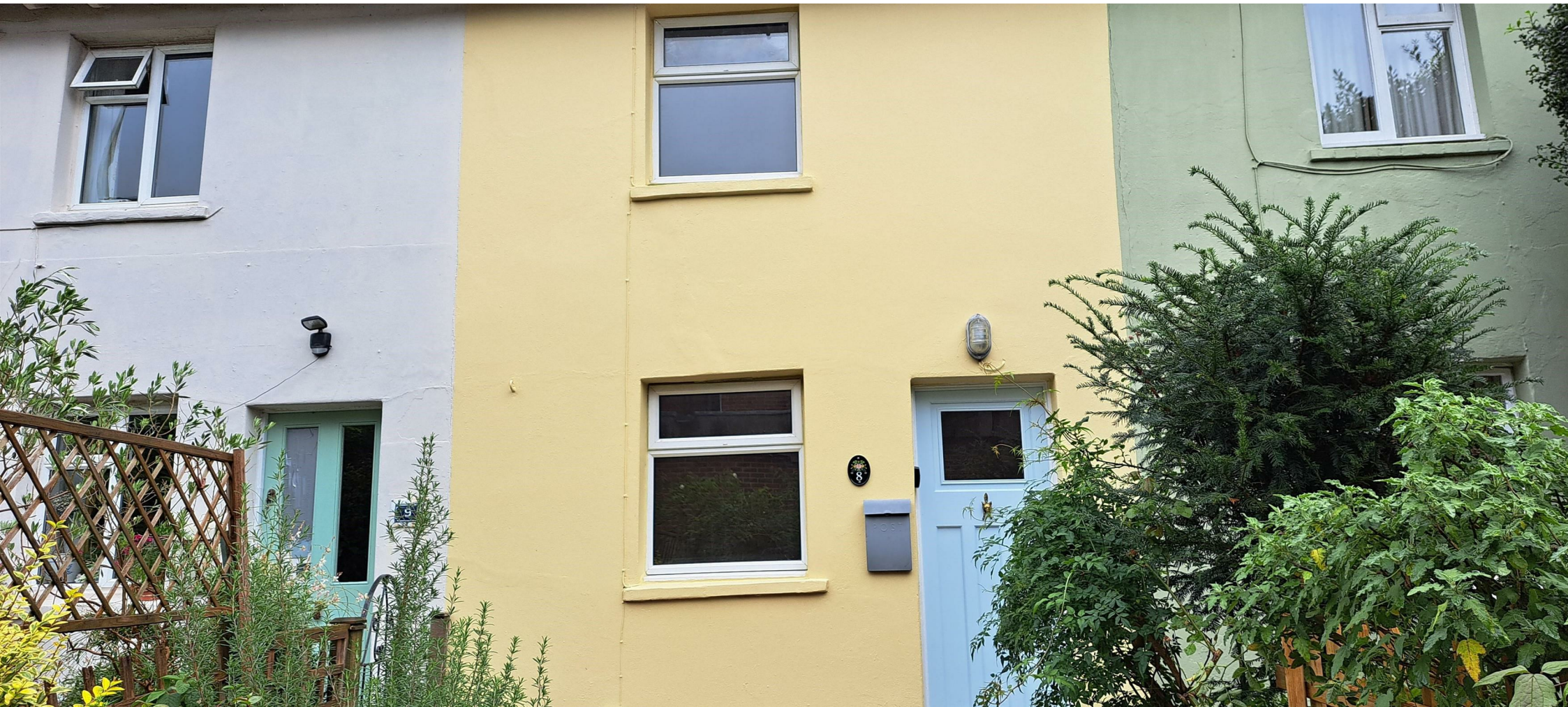
English's Passage, Lewes